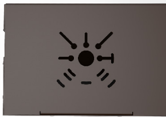
Universal Slotted Rear Panel Shown