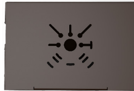
Universal Slotted Rear Panel Shown